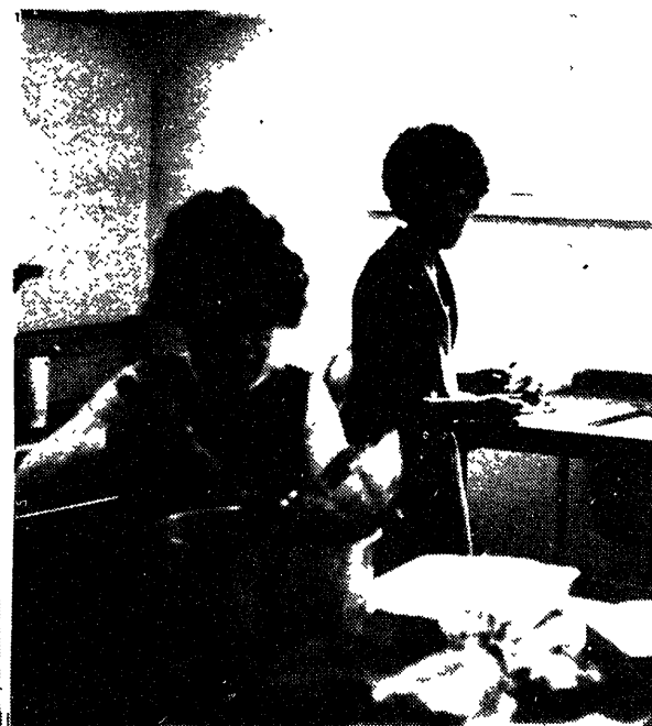
KITCHEN IN THE FREEDOM SCHOOL