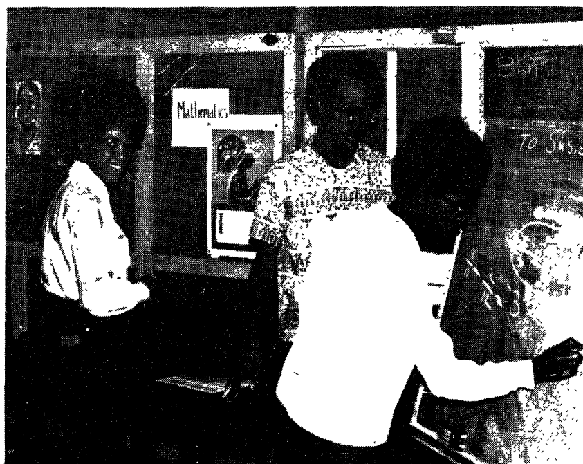
THE YOUNG ONES AT FREEDOM SCHOOL

Dept 6 116 West 14 St N.Y., N.Y. 10011 $7 a year students $5 (foreign add $1)